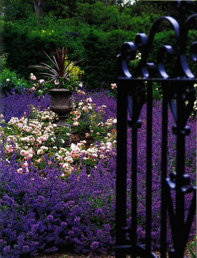
CLOCKWISE FROM TOP LEFT White Rosa 'Alba Maxima', pink R. 'Président de Séze' and dark R. 'Nuits de Young'. Cirsium rivulare 'Atropurpureum'. Catmint and lady's mantle line a garden path. Rosa 'Du Maître d'Ecole'. In the 'secret garden', Phormium 'Sundowner' grows with Rosa 'Felicia' and Nepeta 'Six Hills Giant'