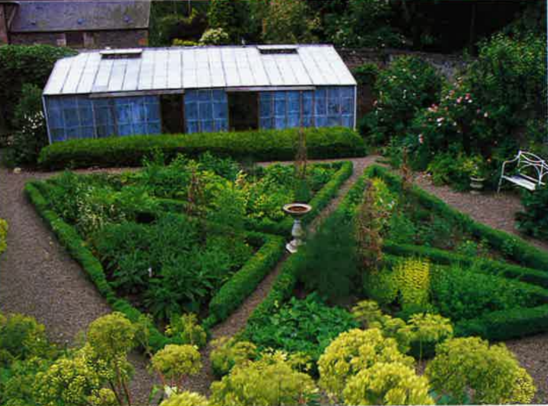
THIS PAGE FROM TOP Striped Rosa gallica 'Versicolor'. In the herb garden, Rose Foyle edged the beds of scented herbs with Buxus sempervirens that she grew from cuttings. Pale-pink Rosa 'Céleste'